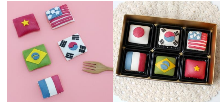
National flag Kit

# In addition to these, there are many designs of kits. And, we will create a sample design as requested.